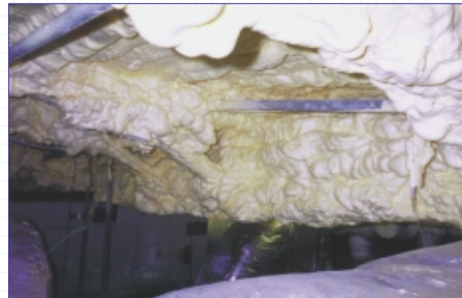
Beams and purlins were covered in Icynene® to ensure there was no conductive heat transfer from the metal roof.

The original renovation plan specified 7 low e double-pane windows. These windows were calculated as not cost effective for this particular project – payback period was 15 years. The building was completed using 7 single pane clear windows with aluminum frames.