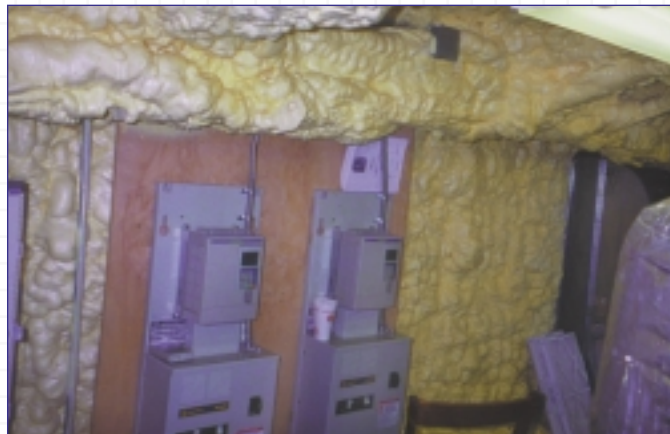
The Icynene® foam was left exposed in the mechanical room, which is located in the upper area of the building.